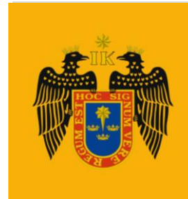
Lima Metropolitan Municipality, Peru

Climate Change Operational Manager, Environmental Protection Agency, Secretariat of Environment